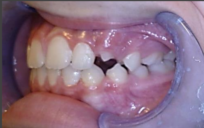
10 MONTH LATER THE END USING FROGGY MOUTH