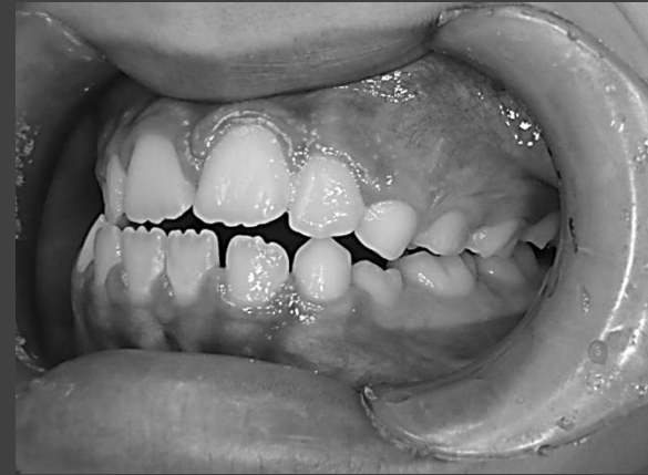
START USING FROGGY MOUTH